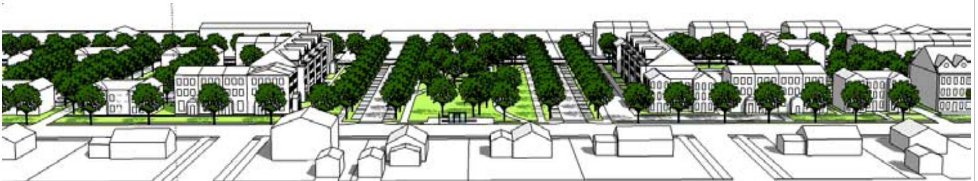
Renaissance Planning Group for the Town of Blacksburg, Virginia